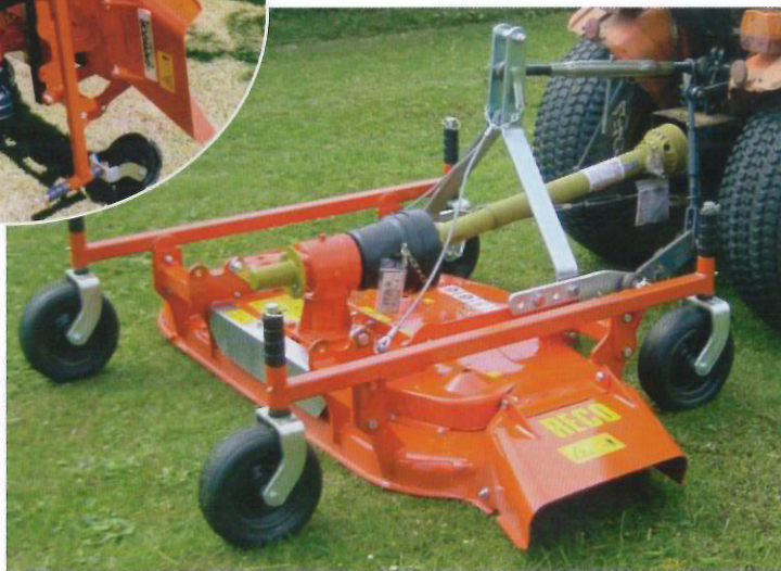
The ultimate finishing mower

As an added benefit, the 'A-frame' hitch speeds up coupling to the tractor.