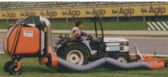
Jet and rear collector at Imola