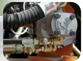
High power hydraulic system.