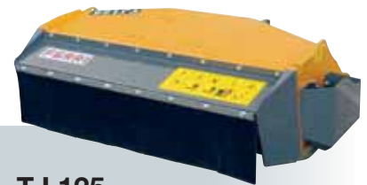
TJ 125 direct drive