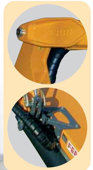
Drop forged arm pivots and flail head linkage.