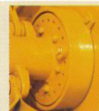
Electronically balanced. The rotor is fitted with balance plates at each end.