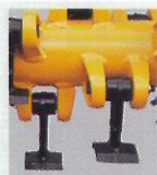
n°18 T-Hammer blades. Ø max cm 6