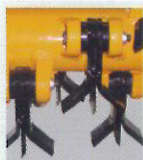
n°36 + 18 Multi-use/straight blades for: grass, shrubs, sticks, wood. Ø max cm 5