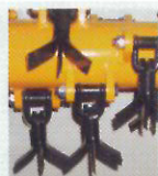
n°48 + 24 Articulated "Y" + straight blades for: grass, shrubs. Ø max cm 2