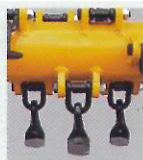
n°24 Hedgecutting flails for: grass, shrubs, hedge. Ø max cm 2