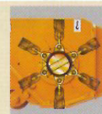
6 rows rotor.