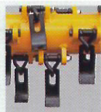
n°24 Hedgetrimming flails for: grass, hedge. Ø max cm 1