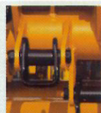
n°18 Tournring blades for wood. Ø max cm 8