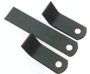
Universal Y flails and scarifier blade

In late autumn and winter, the standard rotor can be replaced with a sweeper rotor for leaf sweeping.