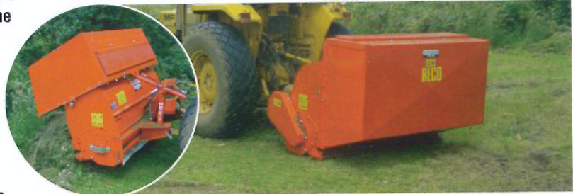
Tidying up the rough

Apart from use as a mower through the summer, it is easy to fit inexpensive accessories to extend the working season. In spring and autumn, the 'Synthesis' can be converted for use as a scarifier.