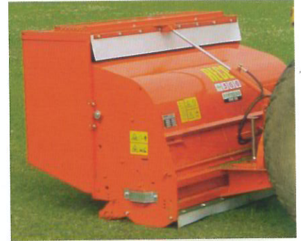
Top class finish